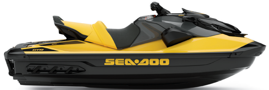
● NEW Millennium Yellow