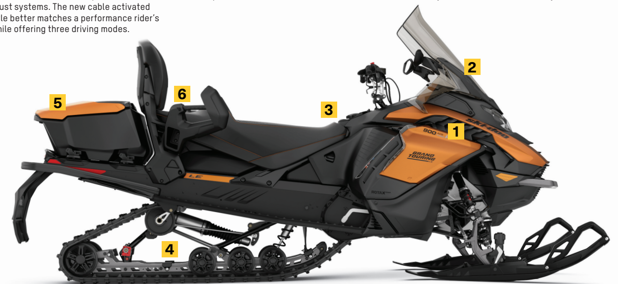
GRAND TOURING LE WITH PLATINUM PACKAGE 900 ACE TURBO R SHOWN

The Platinum Package includes a 10.25" color touchscreen display with built-in GPS, premium LED headlights, studded 1.25" track, forward adjustable riser and Pilot TX adjustable skis.