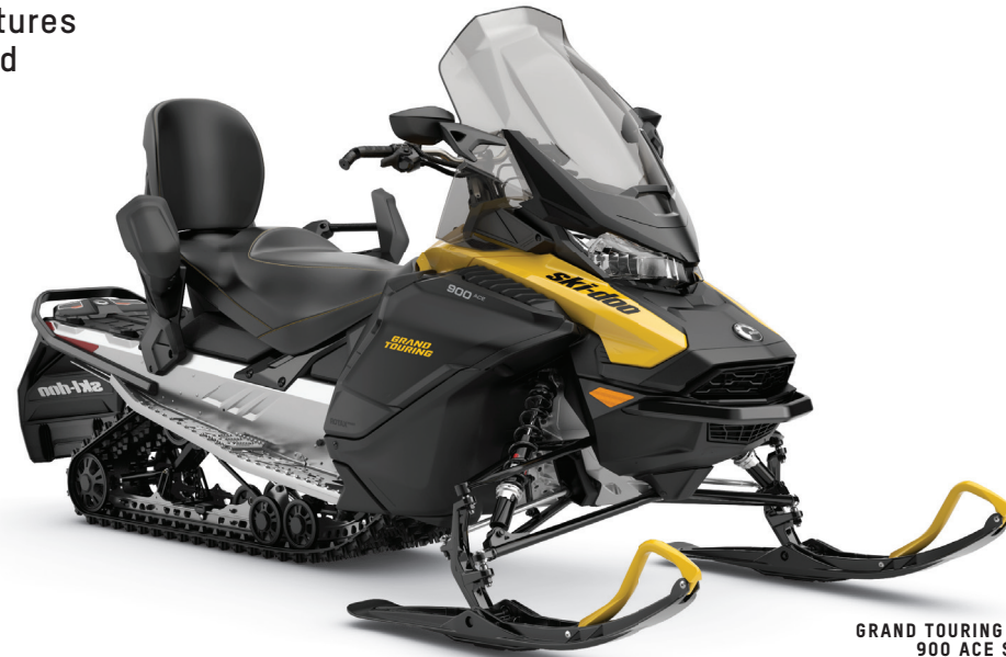
GRAND TOURING SPORT 900 ACE SHOWN

Trail comfort and 2-up features with precision handling and savvy style.