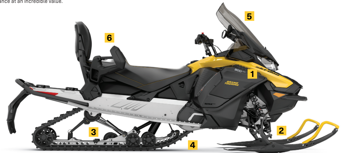
GRAND TOURING SPORT 900 ACE SHOWN

High-quality KYB 1 high-pressure gas shock for excellent performance and reliability.