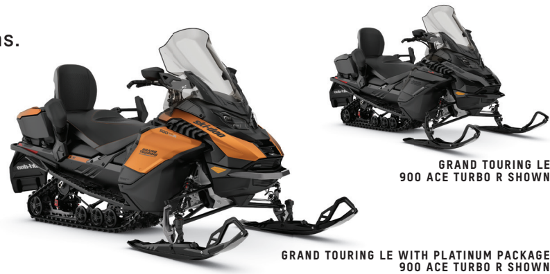
GRAND TOURING LE 900 ACE TURBO R SHOWN